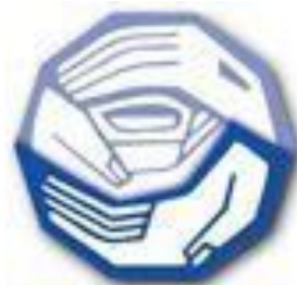
The hand of suffering receives the cup