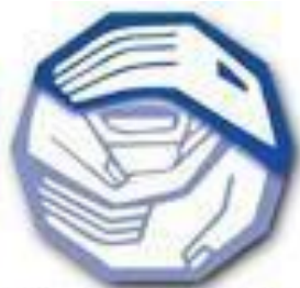
The hand of Christ blesses the cup