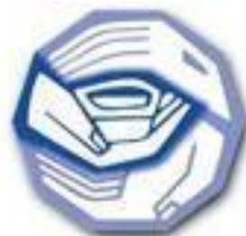
The hand of love offers the cup