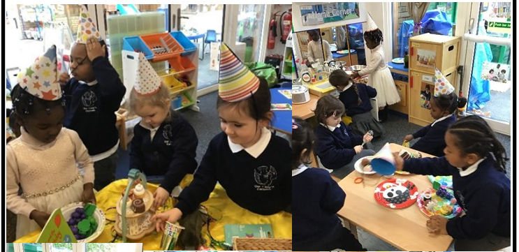
We role played having a birthday party.