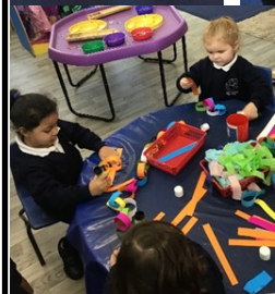
We made poppies on Monday for Remembrance Day.