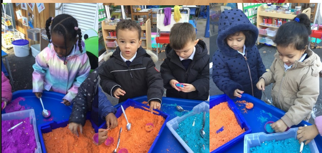
We also used cloud dough to make birthday cakes.