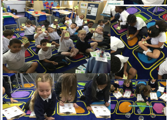
We then counted the amount.

Some of our estimates were so good we guessed only one or two objects more/less than there were in the jar.