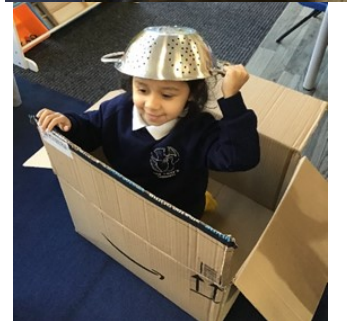
We used props to retell the story.