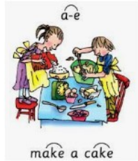
make a cake