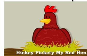
Hickey Pickety My Red Hen

Hickey Pickety my red hen, She lays eggs for Farmer Ben, Farmer Ben comes every day, To count how many eggs lie in the hay. She's laid TWO eggs today!