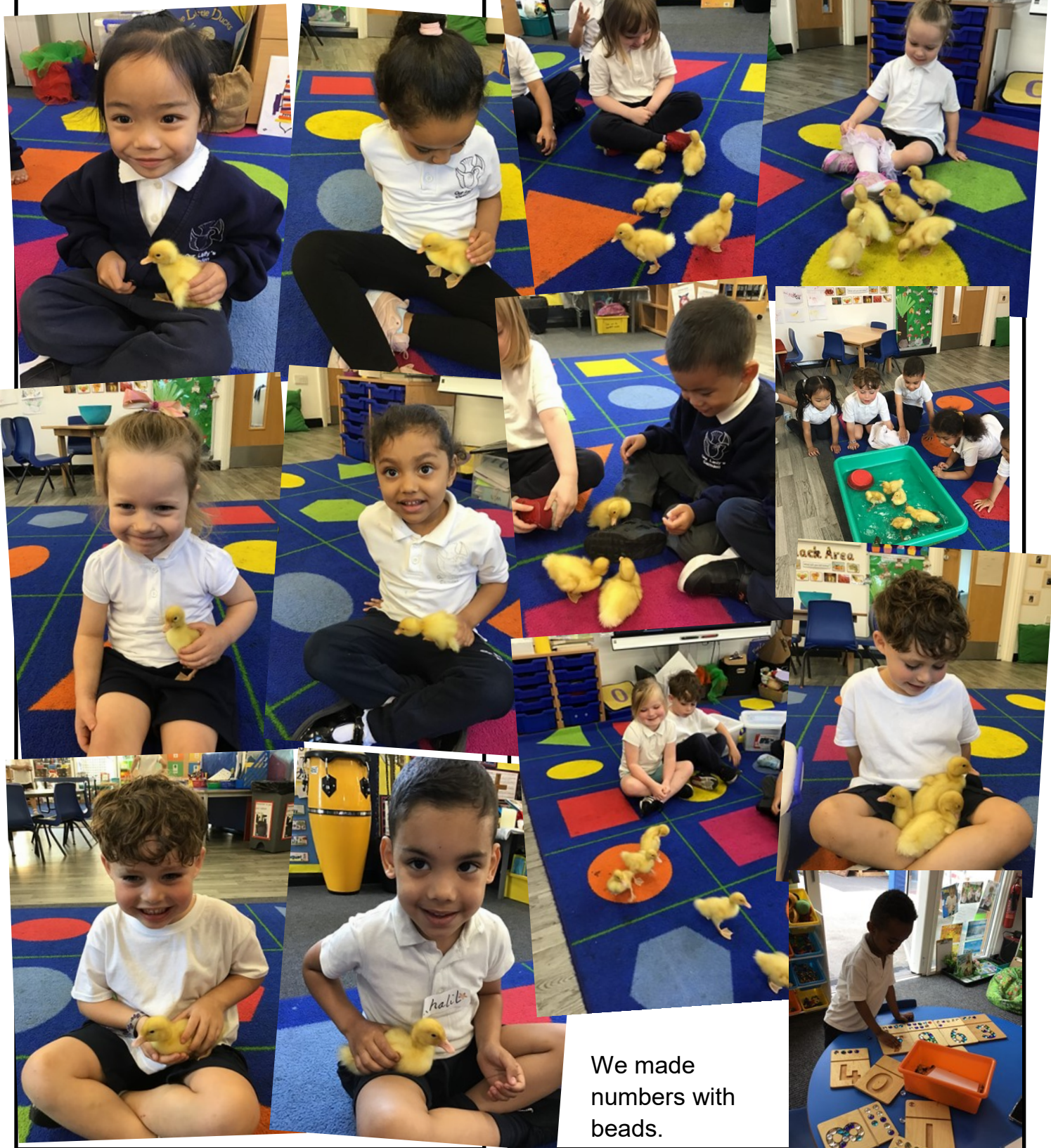
We made numbers with beads.