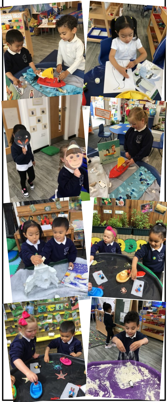
We collaged penguins and retold the story.