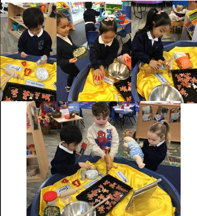
We used props to retell the story.

This week we have been reading Biscuit Bear.