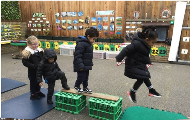
We made bridges out of a wide variety of materials.