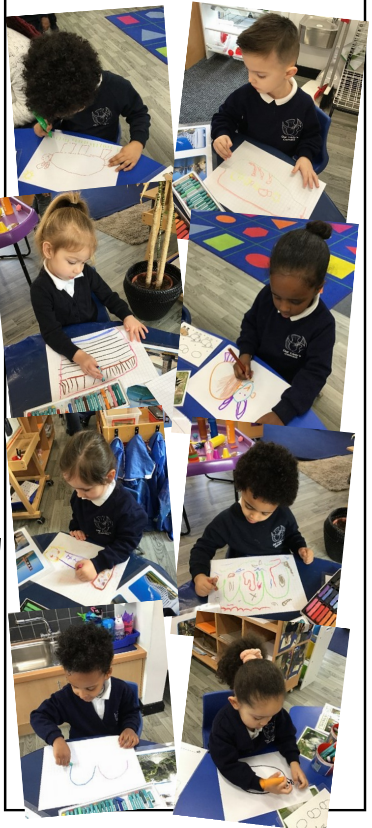
We drew goats and bridges.