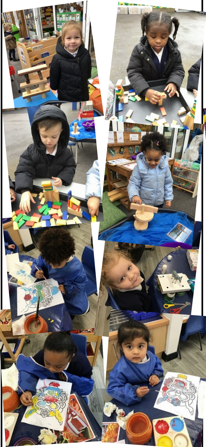
We mixed colours to paint dragons to celebrate Chinese New Year.